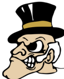
Wake Forest School of Medicine DEMON DEACONS