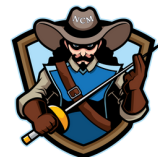
Norton Community Hospital MUSKETEERS