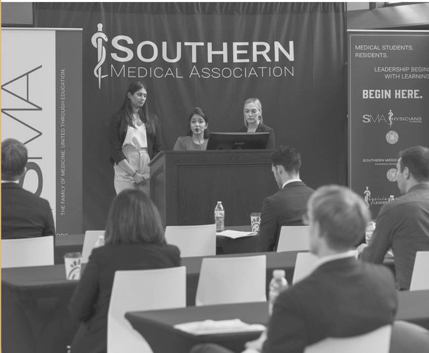
Student abstract presentations at the 2023 PIT Conference