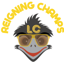
Lake Cumberland Regional Hospital EMUS