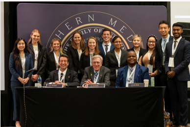
The 2023 VAC Top 10 Poster Presenters with SMA Leadership at ASA 2023