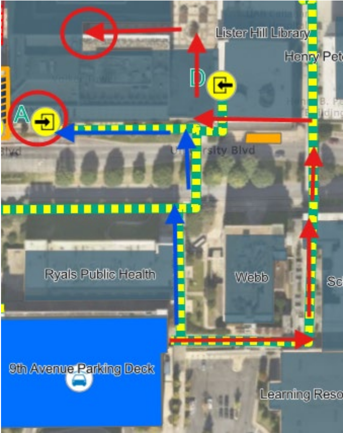
Parking Map Accessing Volker Hall from the Parking Building